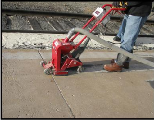
#1 - Shot blast platform