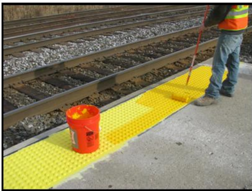
#7 - Apply 2 coats #4 Sealer allowing min. 1 hour between coats . Allow to cure 12 hours before opening up to traffic