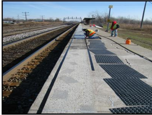
#2 - Lay out molds along edge of platform