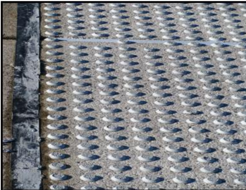
#4 - Carefully remove molds from domes