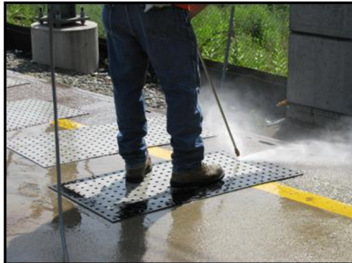
#5 - Wash molds