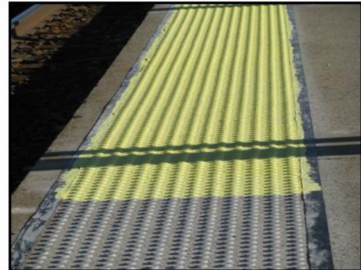
#6 - Apply 2 coats #32 Field mixture, allowing min 1 hour between coats. Allow final coat to cure min.12 hrs